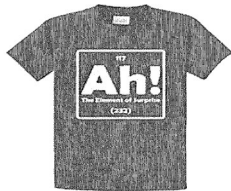
Hunter/Olive Green plus WHITE DESIGN

*Will include "School of Science and Technology-Discovery Science Olympiad"